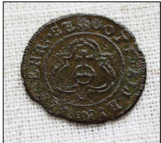
One of three recovered Hans Krauwinckel II Jetons made in Nuremberg between 1585 and 1635